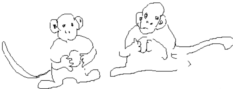
New Competitive Sport: Texting (even monkeys can do it)