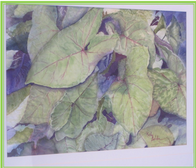
Lush Greens