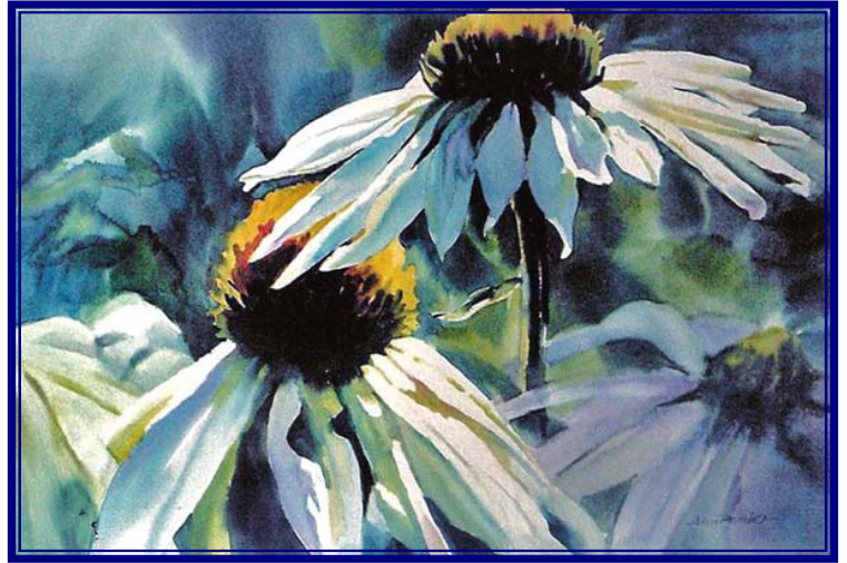
White Echinacea , Ann Pember

Learn to paint flowers and landscapes with clean, luminous color and dramatic design on traditional and smooth surfaces. Students of all levels will be encouraged to develop a personal style and strengthen their skills. Ann's workshops are based on careful planning and step by step instructions.