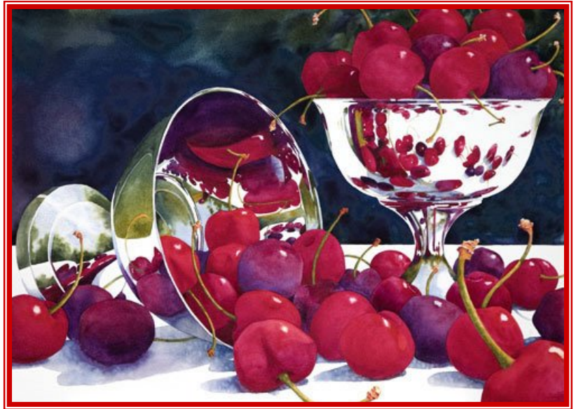
Life is Just. . . #6 by Sue Archer. All rights reserved.

This is a workshop designed for advanced beginners through accomplished artists to inspire your creativity stressing composition, design structures, color theory and design concepts. You will experience ways of getting familiar with your subject matter, organizing and dealing with backgrounds and building different design structures to vitalize and unify your paintings' content. There will be a different lesson or design project each day. Students are asked to bring in their unfinished work and/or photos of your work for assessment by the instructor, as research material or to redesign them.