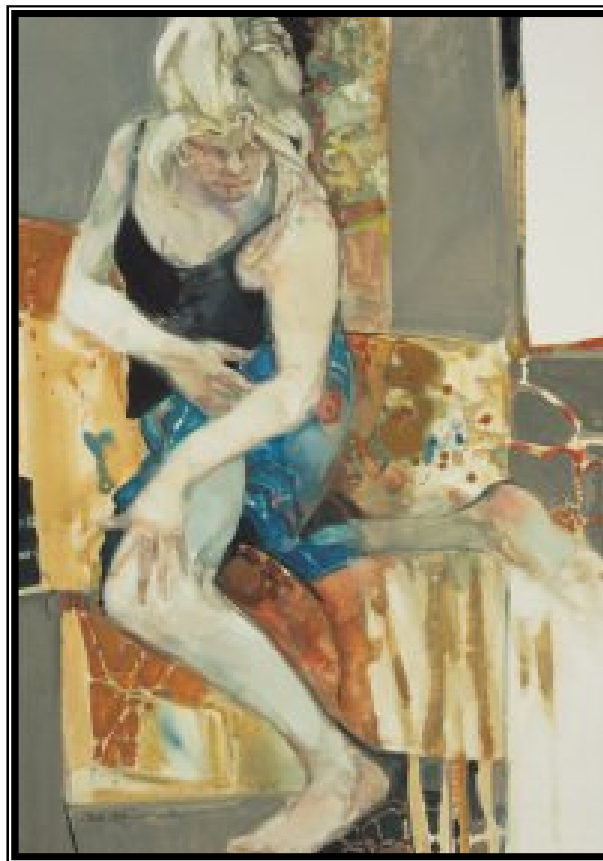
New York Model by Carla O'Connor. All rights reserved.

This workshop stresses bold composition and strong design using the human figure for inspiration. A different aspect of design is the focus of each day's lesson: shape, light, linkage, texture, space, etc. We will explore abstraction, emphasize "the process" and concentrate on composing the entire page. There will be clothed models each morning that will be our subject for finding as many different ways as possible of "seeing." Each participant's preferences, originality and creativity are most important. Carla will be using transparent watercolor and gouache and include frequent mini-demonstrations with this medium in a direct painting method.